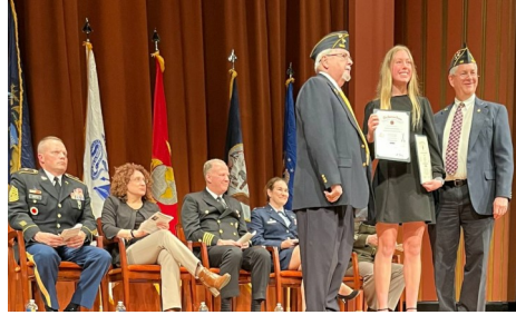
ROTC Award Presentation

A staple in Ann Arbor since 1919, Post 46 is rich in history of serving veterans and the local community. If you know of a veteran that does not have an American Legion home give them a copy of this newsletter. Invite them to come out to one of our meetings and see what we are about. Let them know that we meet on the first Thursday of each month at 1830 hrs. at our post, located at 3230 S. Wagner Rd.